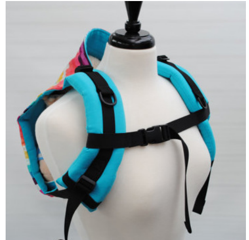
SewToot BuckleBu