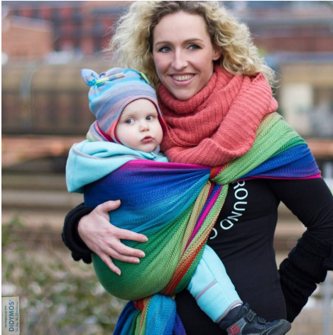
Didymos LISCA Rainbow Robins Hip Carry