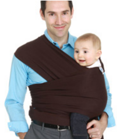
MOBY Wrap Classic Hip Hold