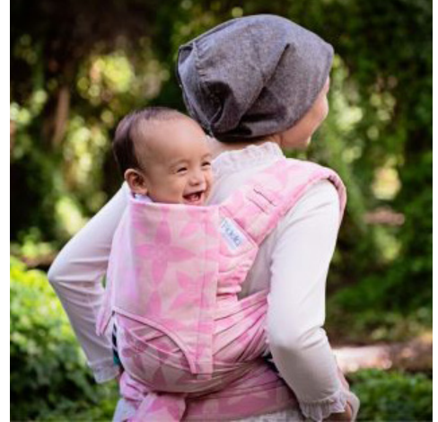
Fidella Fly Tai Blossom Bubble Gum Padded-to-wrap straps