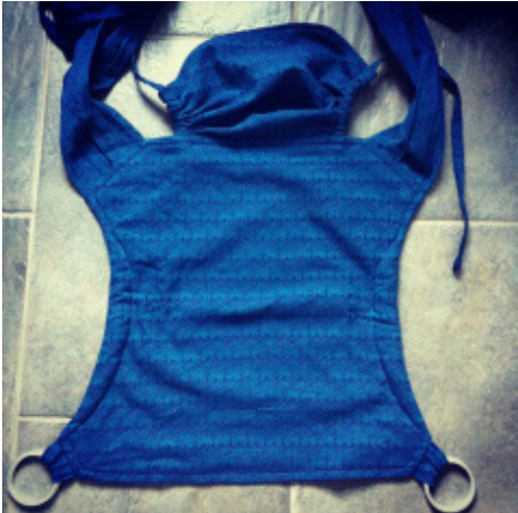
Traditional Onbuhimo