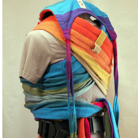
Half Buckle Wrap Conversion Mei Tai with hood