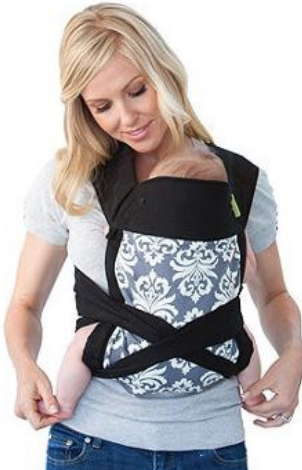
Infantino Sash Mei Tai Padded straps

varies by brand, infant size usually around 30lbs