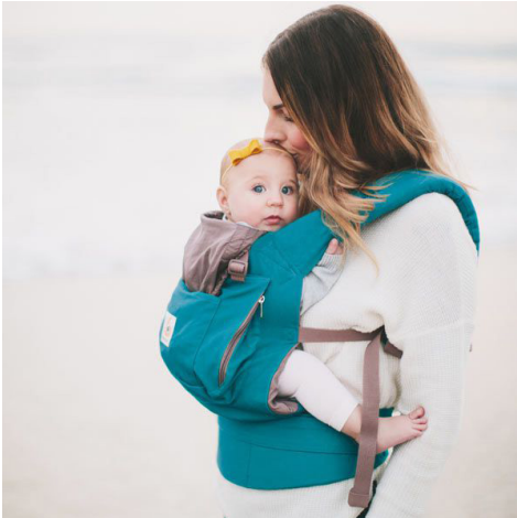
Ergobaby Original Baby Carrier Teal Ergonomic Carrier, Front Carry

Weight limit: varies by brand, infant carriers usually around 30 lbs