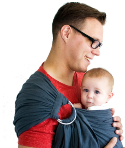
ComfortFit Sling Maya ComfortFit Shoulder