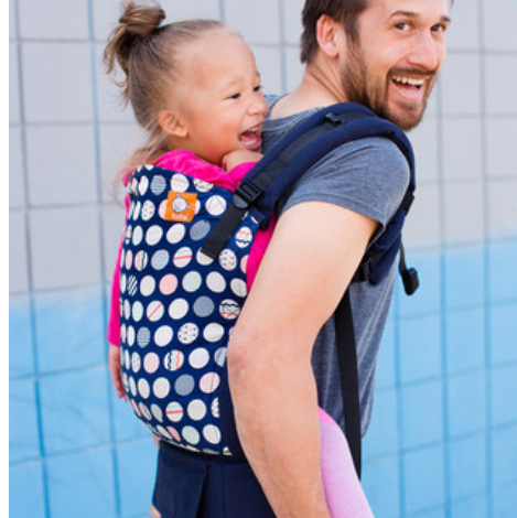
Tula Toddler Carrier - Trendsetter Navy Ergonomic Carrier, Back Carry