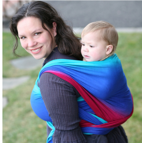
Wrapsody Hybrid MEIRA Stretch Wrap Double Hammock Back Carry