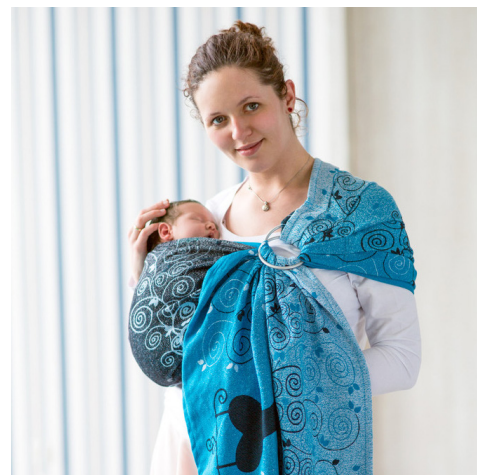
Lenny Lamb Blue Princessa Wrap Conversion RS Pleated Shoulder