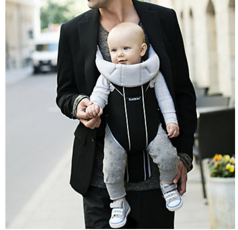
BabyBjorn Miracle Carrier Narrow Based Carrier, Forward Facing