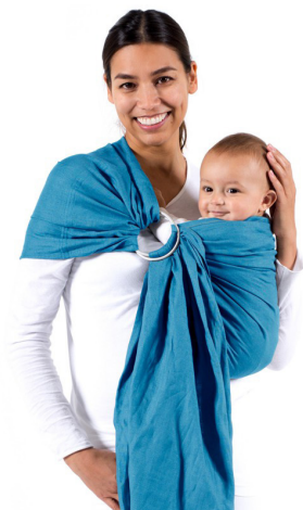
Beco Ring Sling Gathered Shoulder

rings rated to 250 pounds, slings weighted to +/-60lbs