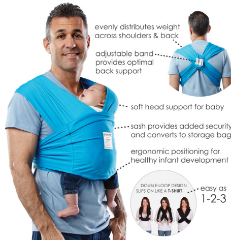
Baby K'tan ORIGINAL