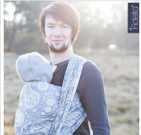
Fidella Persian Paisley Smoke Wrap Front Wrap Cross Carry